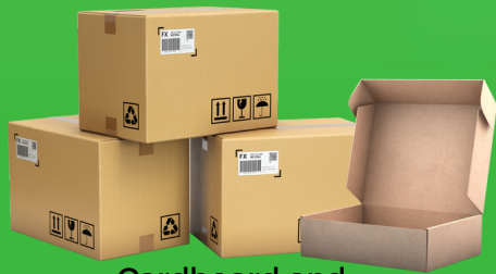
Cardboard and paper gift boxes