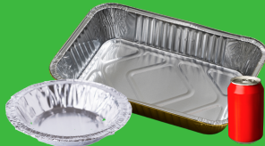
Clean aluminum and metal cans