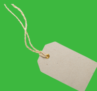
Paper gift tags