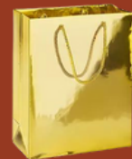
NO metallic gift bags