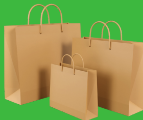
Uncoated gift bags