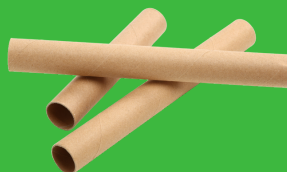
Wrapping paper tubes