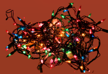
NO holiday lights