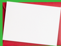
Paper greeting cards