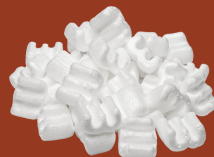
NO styrofoam peanuts