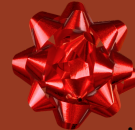
NO bows or ribbon