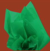
NO tissue paper