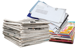
Paper, Newspaper, Magazines & Junk Mail (No Need to Tie or Bundle)