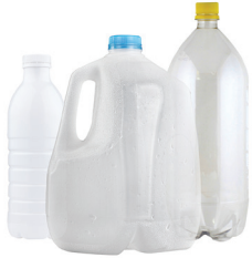
Plastic Bottles, Milk Jugs & Detergent Bottles (Plastic ♻️ ♻️)