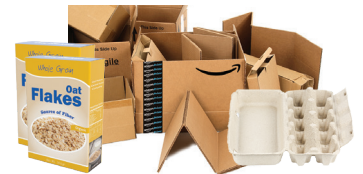
Cardboard, Paper Containers & Cartons