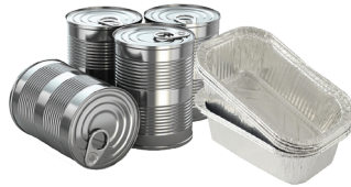
Metal Cans, Aluminum Containers & Foil (Rinse & Clean)